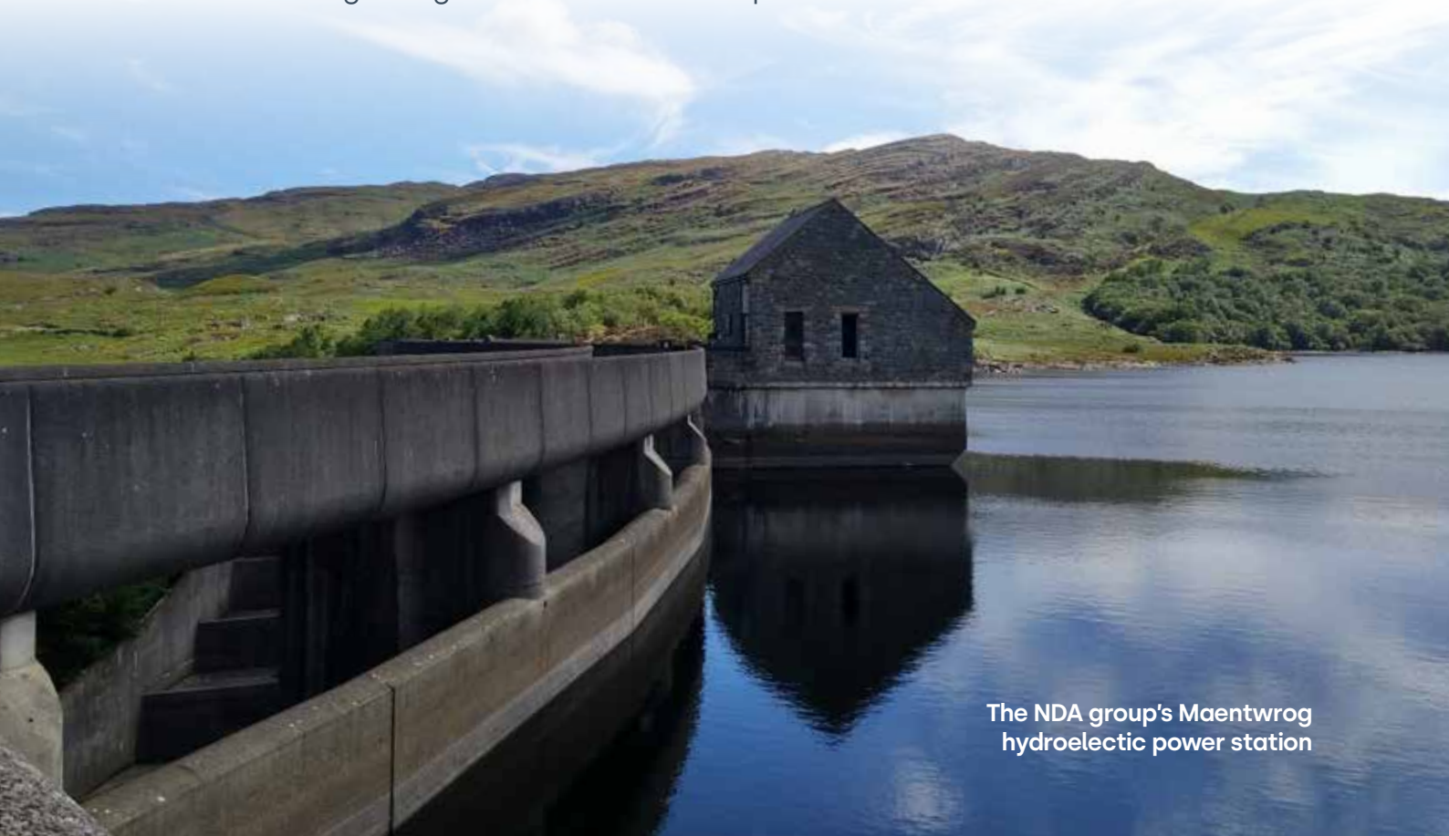
The NDA group's Maentwrog hydroelectric power station

We are trusted across government, industry and internationally, where we share knowledge and collaborate on global challenges. With a mission that spans more than a century, we are guided by long-term vision and a commitment to public safety, environmental protection and public value.