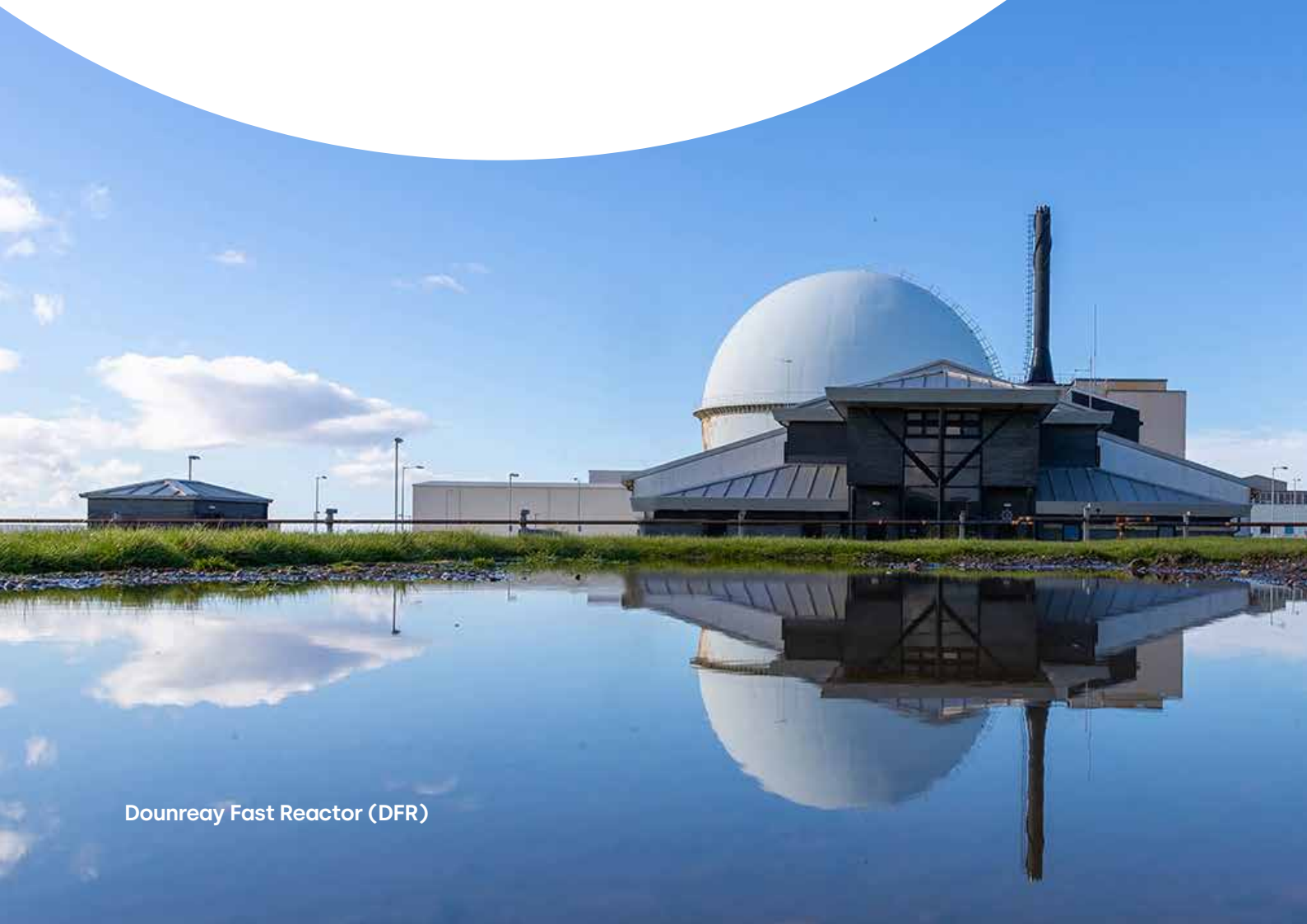
Dounreay Fast Reactor (DFR)